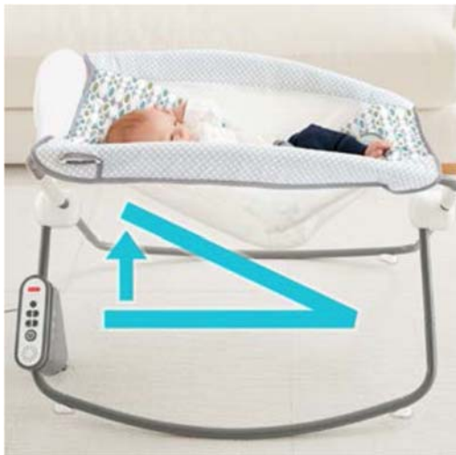
Above: Figure 2