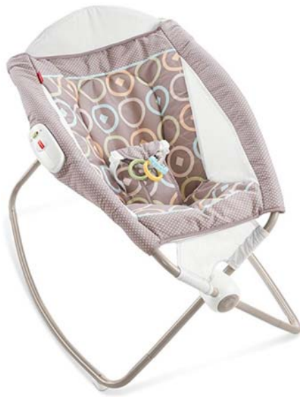
Above: Figure 4