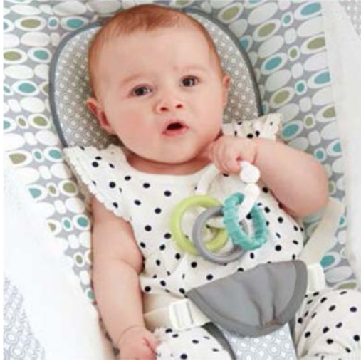
Above: Figure 3