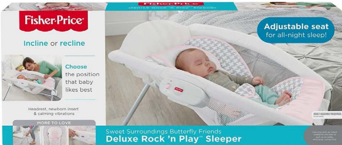
Above: Figure 8

97. The marketing statements on the packaging conflict with the AAP’s guidelines and recommendations, and those of other infant sleep experts.