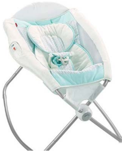
Above: Figure 5

33. Some “Premium” and “Deluxe” models, such as the deluxe model immediately above, have additional padding around the head.