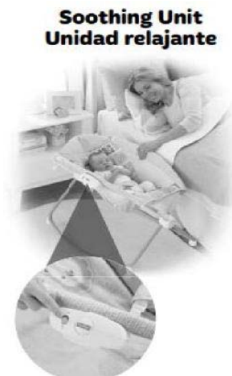
Above: Figure 11

129. The manuals are also misleading beyond the inadequate and misleading warning section. For example, the manuals show images of mothers lying down in bed, covered with blankets, which indicates either that they are ready for sleep or awakening from sleep. Below is an example: 54