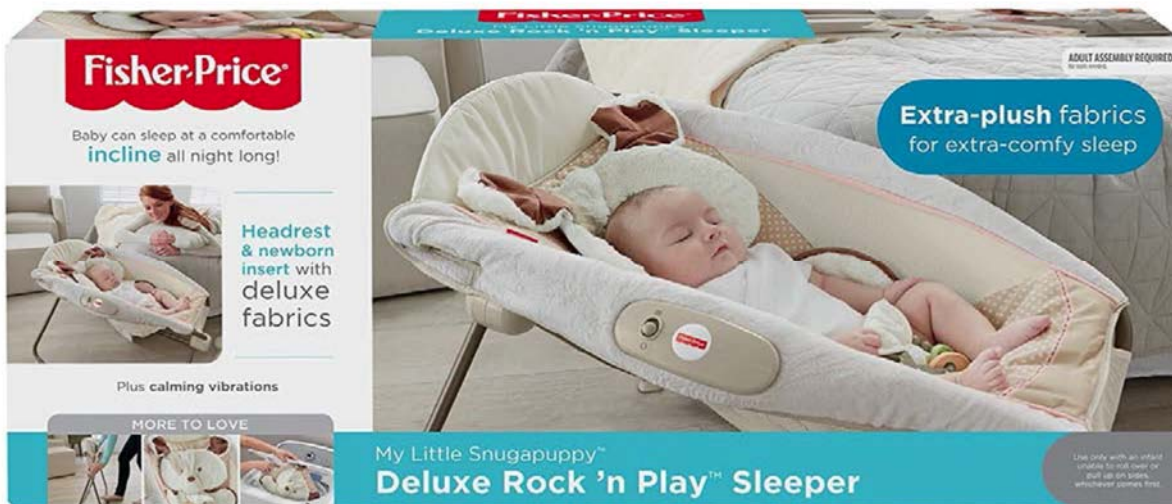
Above: Figure 6

96. One of the principal means of in-store advertising is the box in which the product is packaged. The boxes prominently tout that the product is suitable for all-night sleep as illustrated by the figures below showing typical packaging: