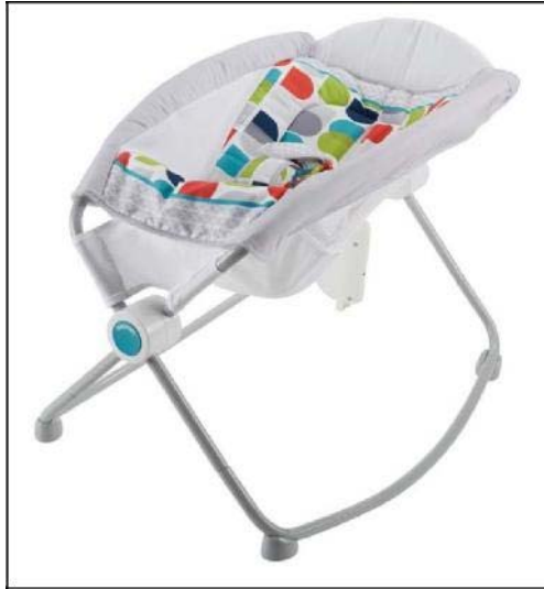
Above: Figure 1