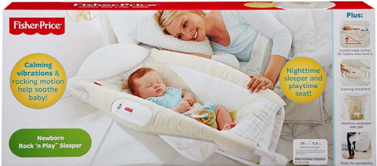
Above: Figure 7